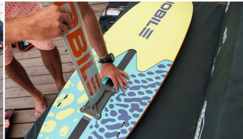
It's a pivotal point of the whole construction, connecting the hydrofoil with the board. Made of high-quality aluminum to make it super-stable and maximally durable.