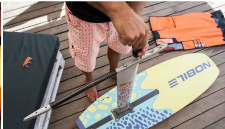
The fuselage is made of aluminium-carbon used in aviation industry.