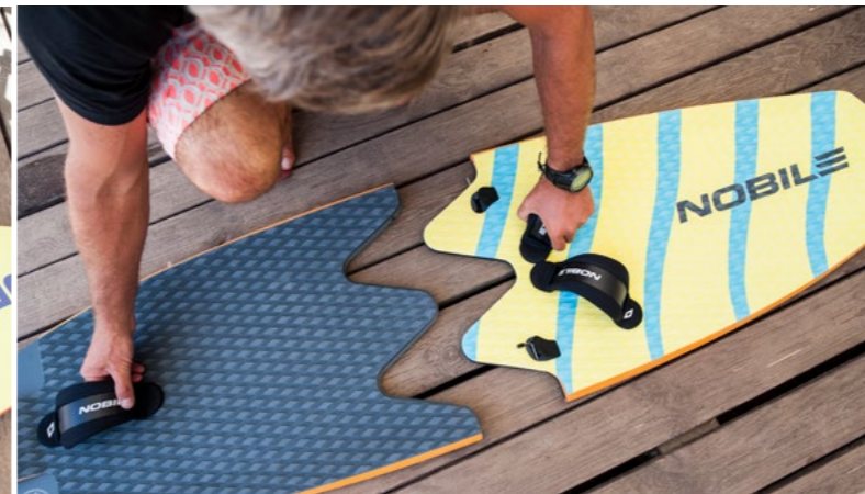
You can easily connect Infinity Foil splitboard in few seconds