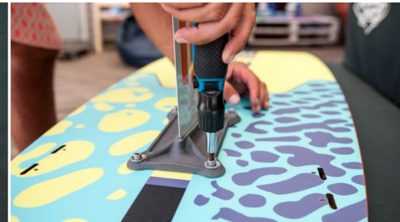
Easy mount mast to platform with 4 screws. Mounting spacing: 165x90 mm.