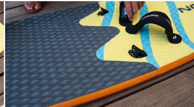
Third generation of the W-Connection patented solution. In 2017 we reduced weight, improved stiffness and durability.