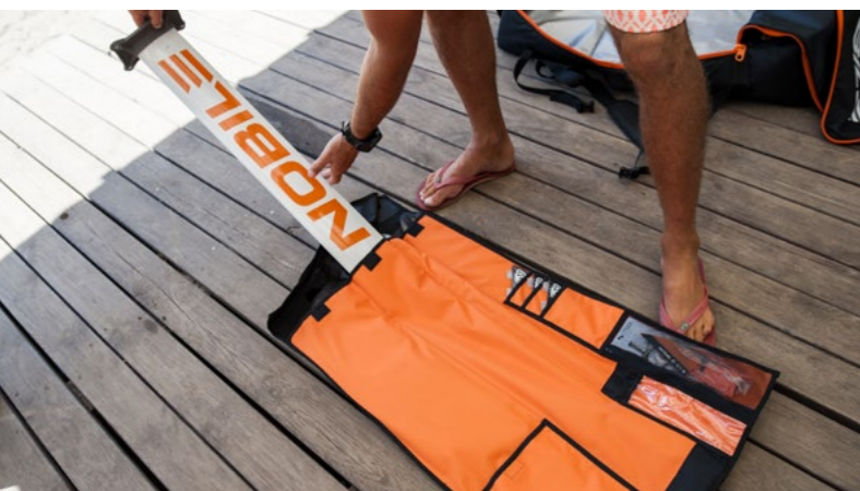
The aluminium mast is extruded from the material used in the aviation industry. It is extremely light and stiff to the maximum. Thanks to the non-drag profile, it has very low resistance in the water (mount with 2 screws)