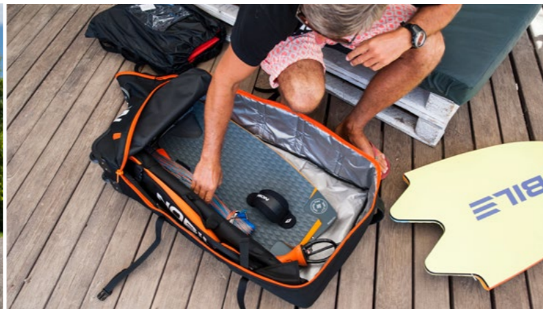
In new Nobile Check Inn Bag you can pack: Nobile Zen Hydrofoil, Infinity Split Foil 5'1", two kites, bars, pump, wetsuits, as well as you favourite T-shirts.