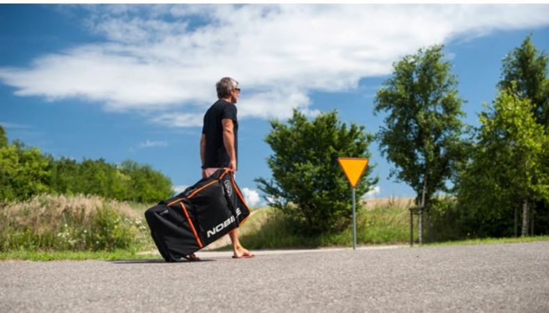
Check Inn Bag just like it sounds – travel without boarders!