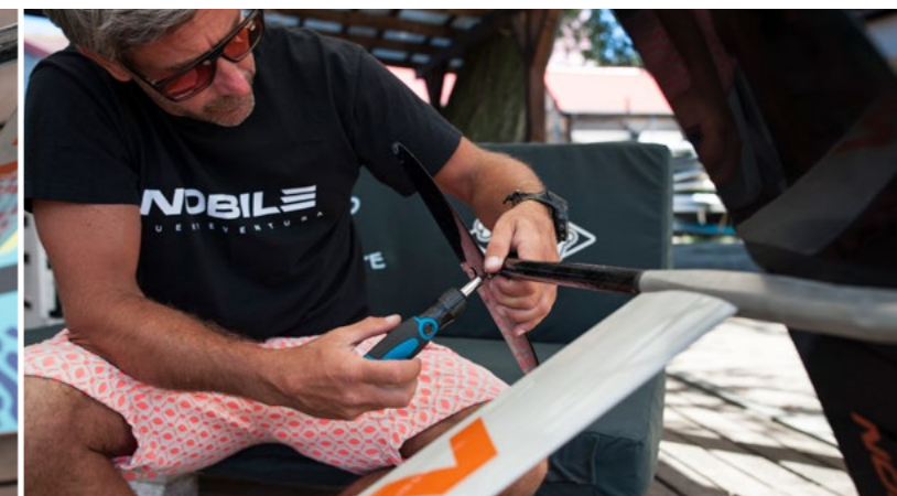
Wings are extremely stable and easy to control. It gains lift quickly which makes it useful also for the beginners.