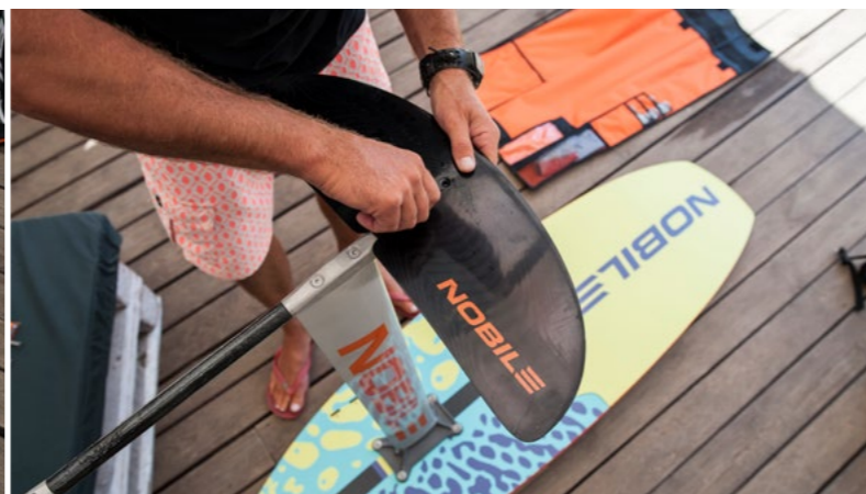
Wings are built of ultra-durable and stiff G10 composite milled with the use of super-precise CNC machines and polished to minimize the water resistance (mount with 3 screws)