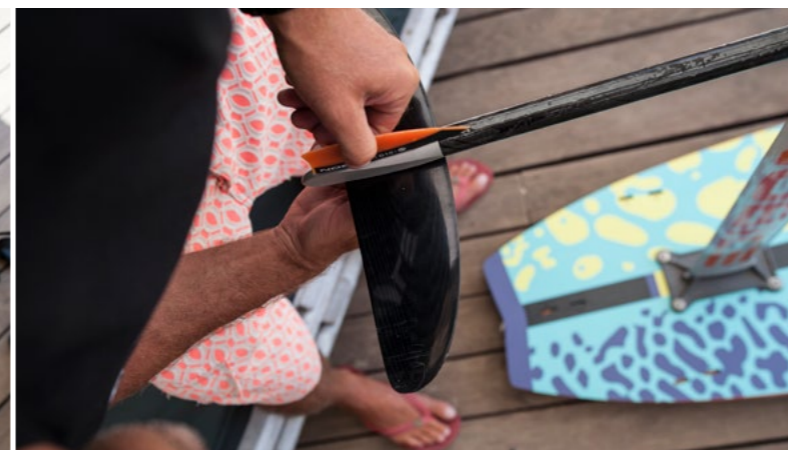
The 40 mm Nobile fin is made of G10 material and serves as an extra stabilizer. You can use other sizes of Nobile G10 fins as well.